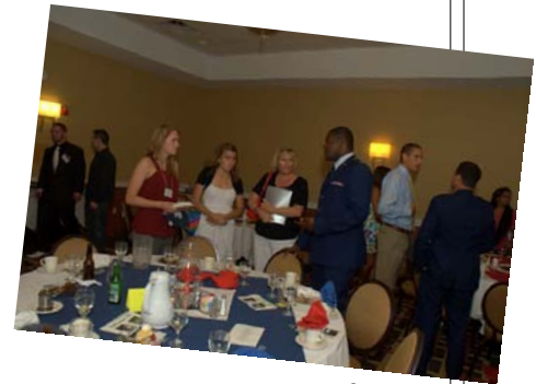
Doolie Dinner 2009

on maximizing their potential while helping them develop into officers of character motivated to lead the US Air Force in service to our nation.” Before this new class entered, USAFA Admissions knew they would be extremely competitive statistically because of their outstanding GPAs, standardized test scores, as well as their exceptional character and