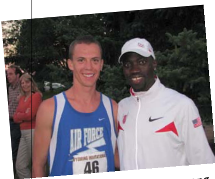
Jim Walmsley with Lopez Lomong at the US Jr National Track meet at Eugene, Oregon