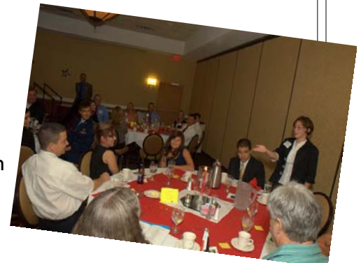
Doolie Dinner 2009